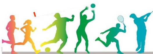
Physical Education Update

Cranford Primary School, Berkeley Avenue, Cranford, Middlesex TW4 6LB